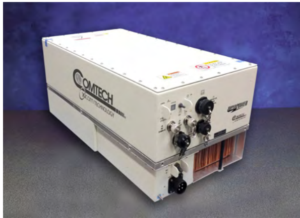
Comtech Xicom's new SuperPower™ TWTA.

brings proven space designs down to the ground and takes established millimeter wave designs and scales them for use at Ku-band frequencies. The result is not only the highest power helix TWT ever offered for these commercial satcom uplink bands, but also an extremely efficient, compact and reliable amplifier that can dramatically lower capital and operations expense.