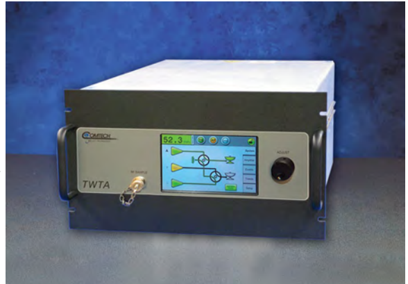
Comtech Xicom's rack-mount SuperPower™ TWTA using indoor rack-mount configurations that incorporate Xicom's TouchScreen front panels for ease of use and access.

"We could not be more pleased with initial customer reactions. Interest in the SuperPower products is the highest we've seen on any new development, because it really does change the business case for SATCOM uplinks. Xicom has a long history of pushing the limits of HPA technology, and we plan to continue that legacy of innovation in ad-